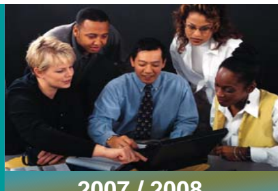
2007 / 2008