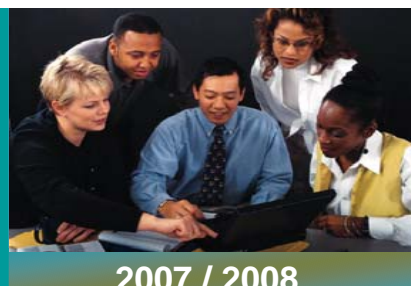
2007 / 2008